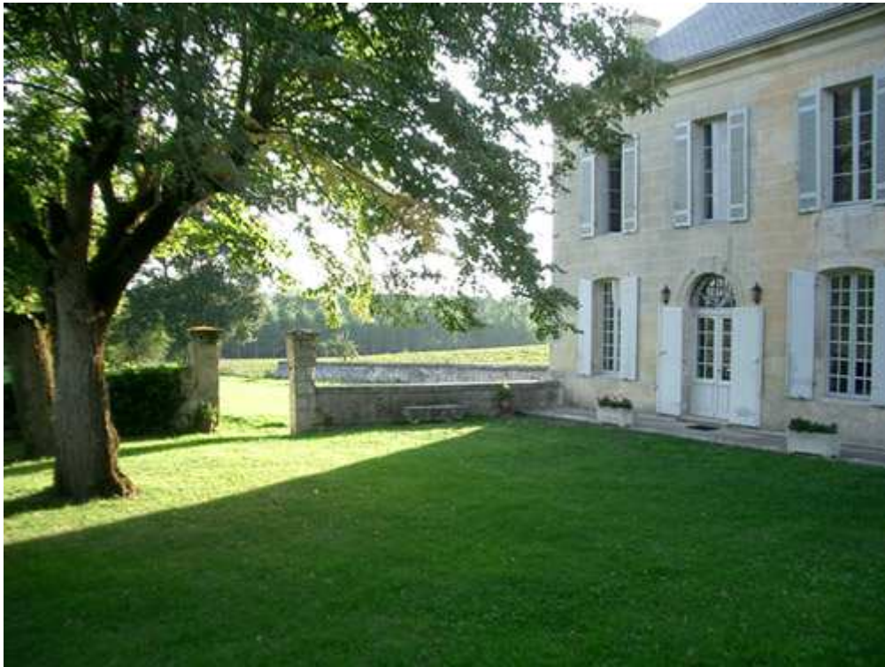
Photo of the Château de Taste